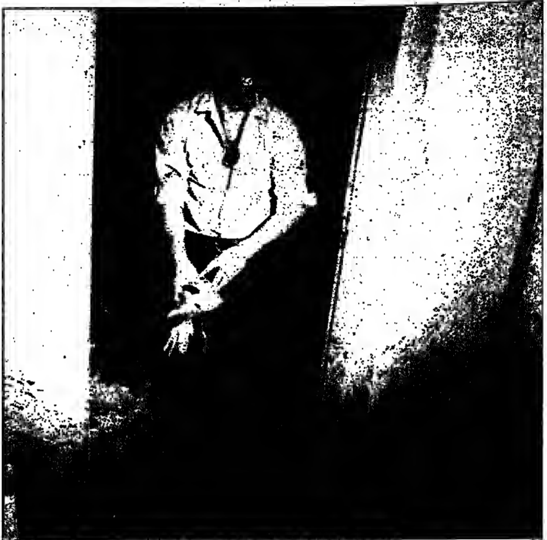
Blood and debris cover a corner of Ben-Gurion Airport's arrivals hall in 1972 after the attack by Japanese Red Army terrorists.